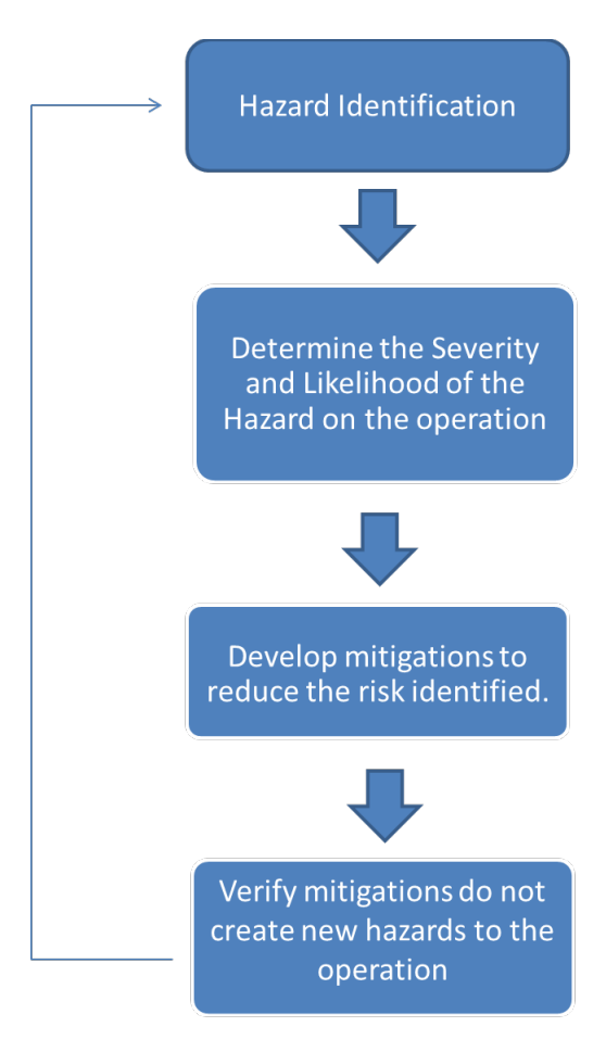
Figure A-1. Hazard Identification and Risk Assessment Process Chart

A.4 Safety Risk Assessment and Mitigation Steps. Before flight, the following Safety Risk Assessment and Mitigation steps should be taken. Figure A-2 in this paragraph is an example of a risk assessment plan in table format to accomplish this task. This example should not be considered a required format. It is designed simply to show one way to document a risk assessment and mitigation plan.